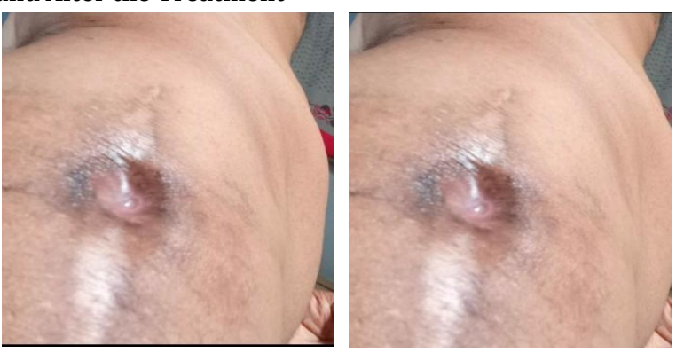
Fig 1: Before treatment wound with discharge, local swelling