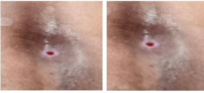
Fig 3: After 30 days of Kajjalikodaya malahara application wound stopped discharge and started healing