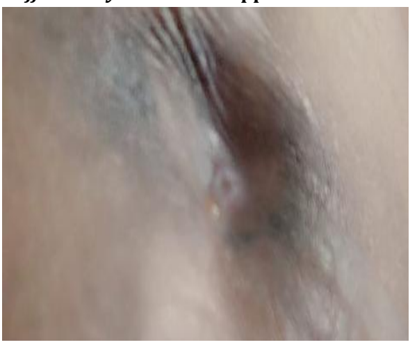
Fig 5: After 60 days of Kajjalikodaya malahara application wound healing completed DISCUSSION

Kajjalikodaya malahara mentioned in the text Rasatarangini has Shodhana- ropana (wound cleaning and healing) properties indicated in Vividha vrana and also in Nadi vrana. It is said that Vrana which is not